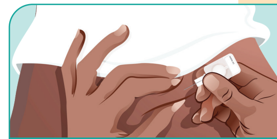
Needle insertion, into abdomen

DMPA-SC is injected into the layer of fat under the skin in the back of the upper arm, the front of the thigh, or abdomen. The skin must be pinched, and the needle inserted straight into the skin at a downward angle by a doctor or nurse.